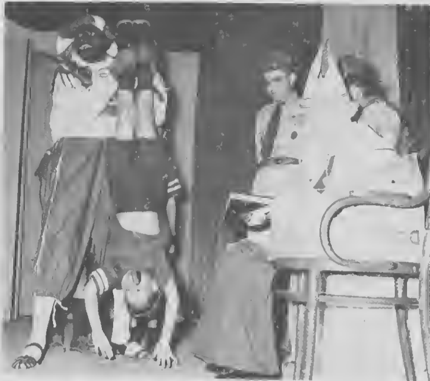
WHEN ONE of the boys demonstrated to Sinterklaas how he could stand on his head, Black Peter demonstrated one of his tricks: holding a small boy up by his ankles.

All of the boys of both Scout and Cub groups attended. On hand too were the parents of many.